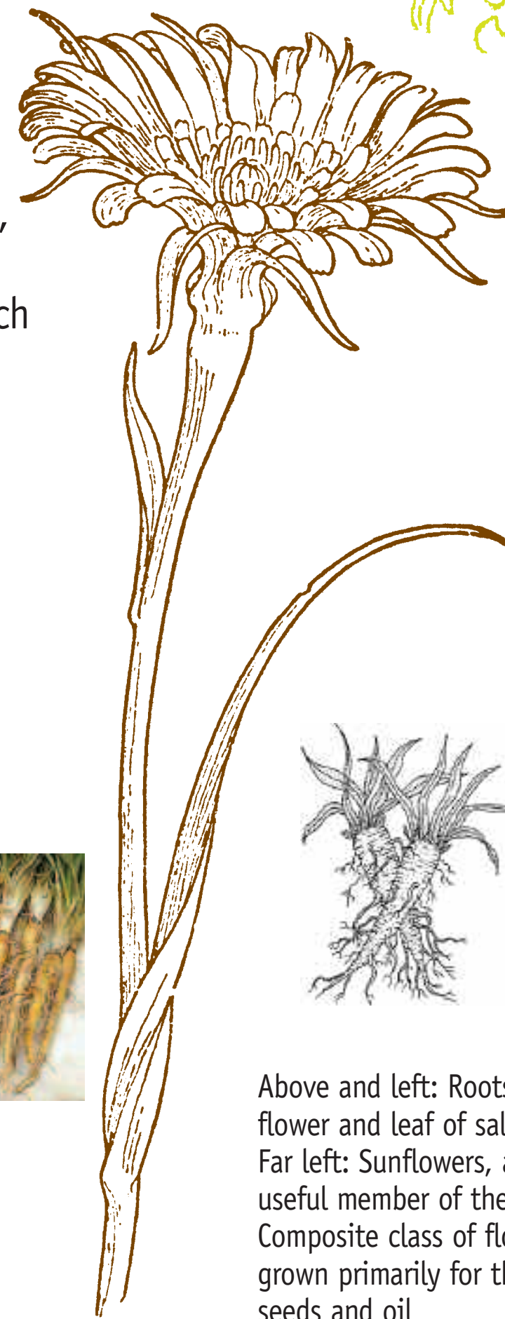
Above and left: Roots, flower and leaf of salsify Far left: Sunflowers, are a useful member of the Composite class of flowers, grown primarily for the seeds and oil