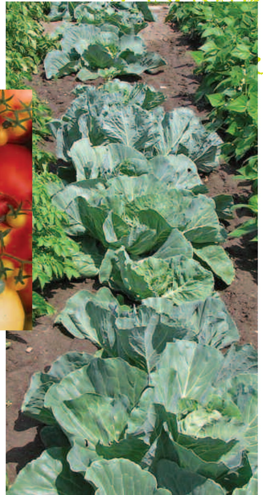
Top left: Varieties of heirloom tomatoes Above: Potatoes, cabbage and beans