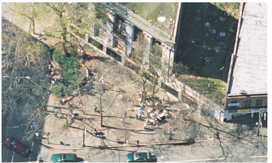
Existing Site Condition