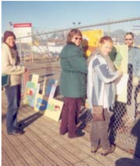
The Art Crew installing Fence Art