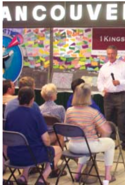
Architect's presentation at July 2003 Open House

We look forward to seeing you at our next public meeting. For more information, visit www.vpl.ca , phone 604.331.4001, or send us an email to info@vpl.ca .