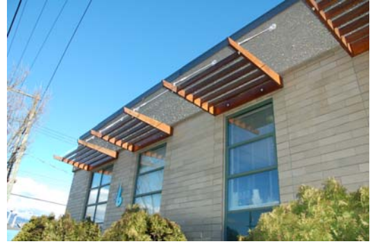
Examples of external sunshades