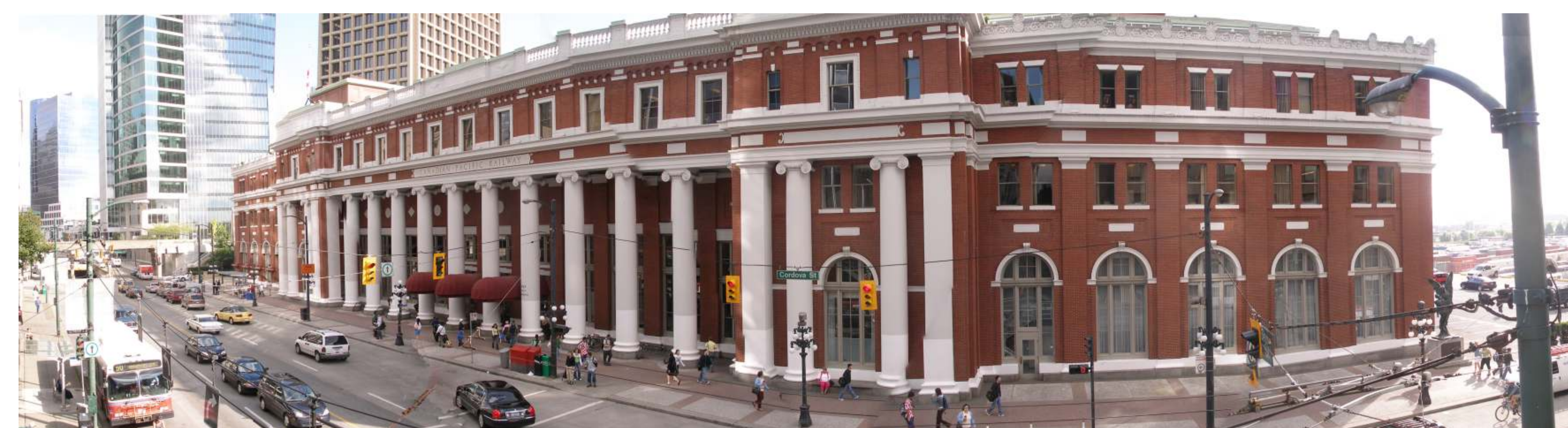
Waterfront Station, Vancouver