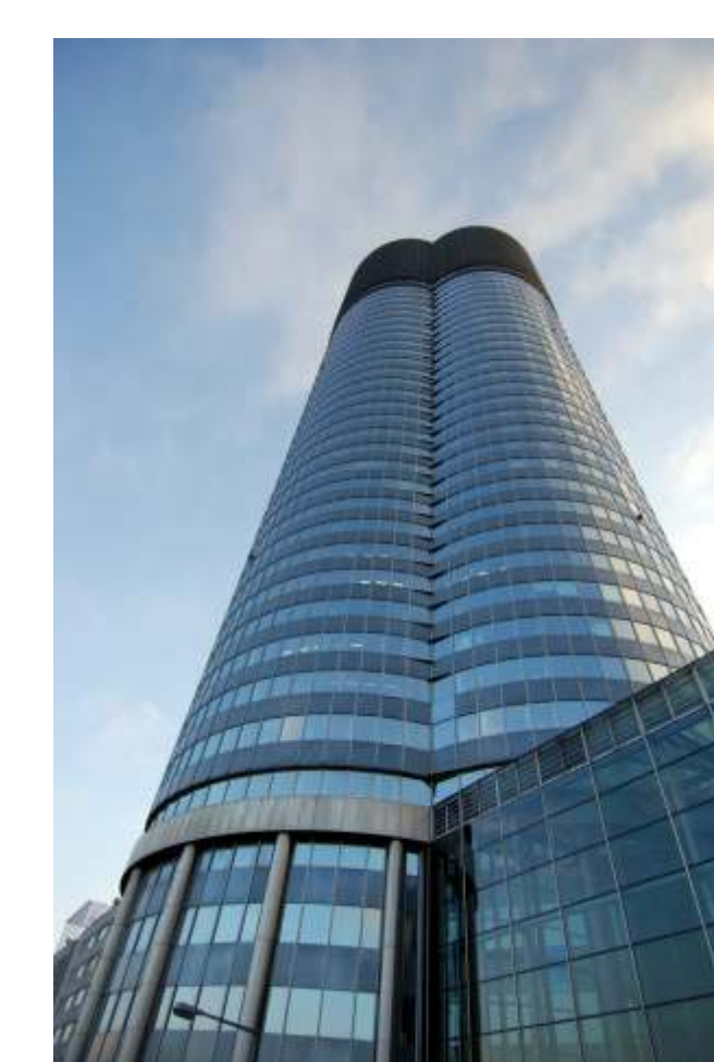
Office tower, Vienna, Austria