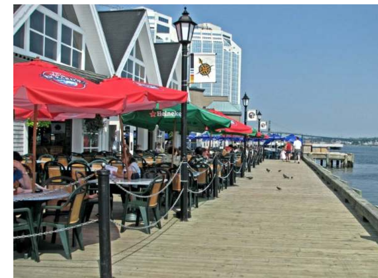
Active waterfront, Halifax, Nova Scotia