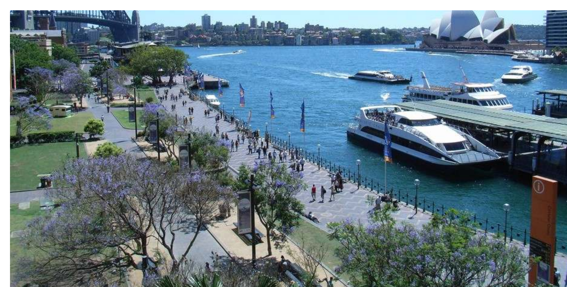
Marine uses & public promenade, Circular Quay, Sydney Australia