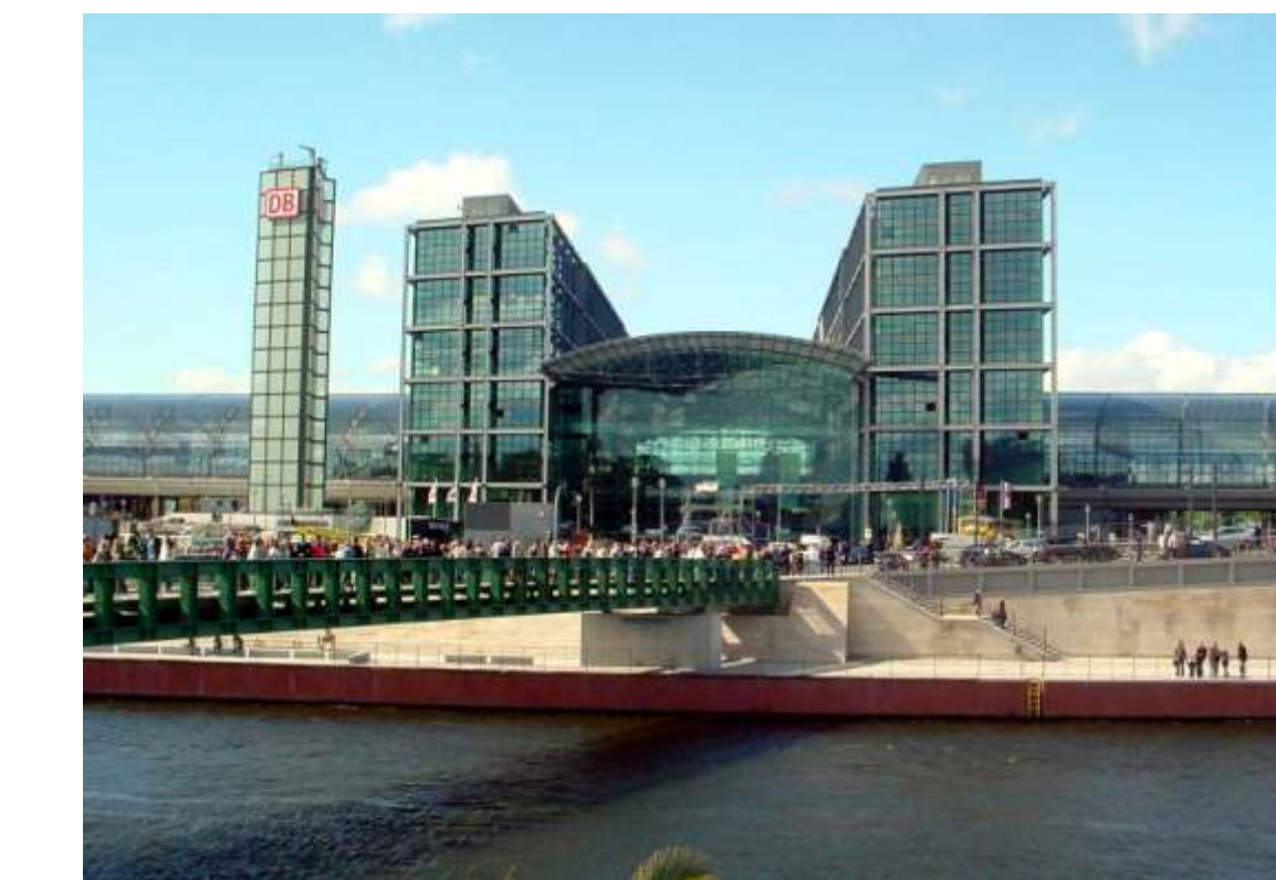
Berlin Central Railway Station, Germany