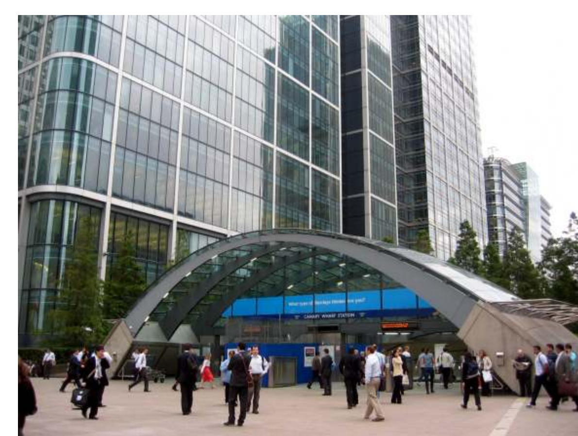
Canary Wharf tube station, London, UK