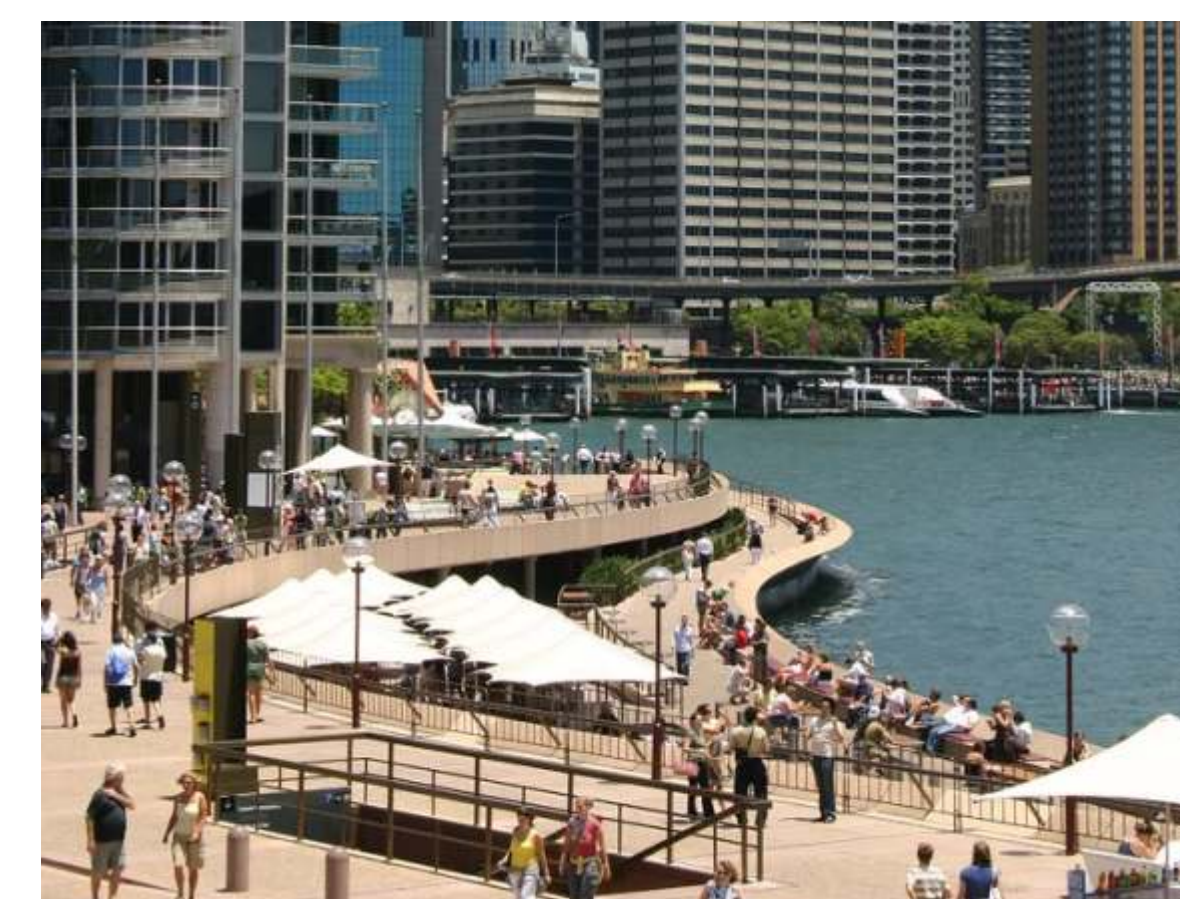
Circular Quay Promenade with café, Sydney Australia