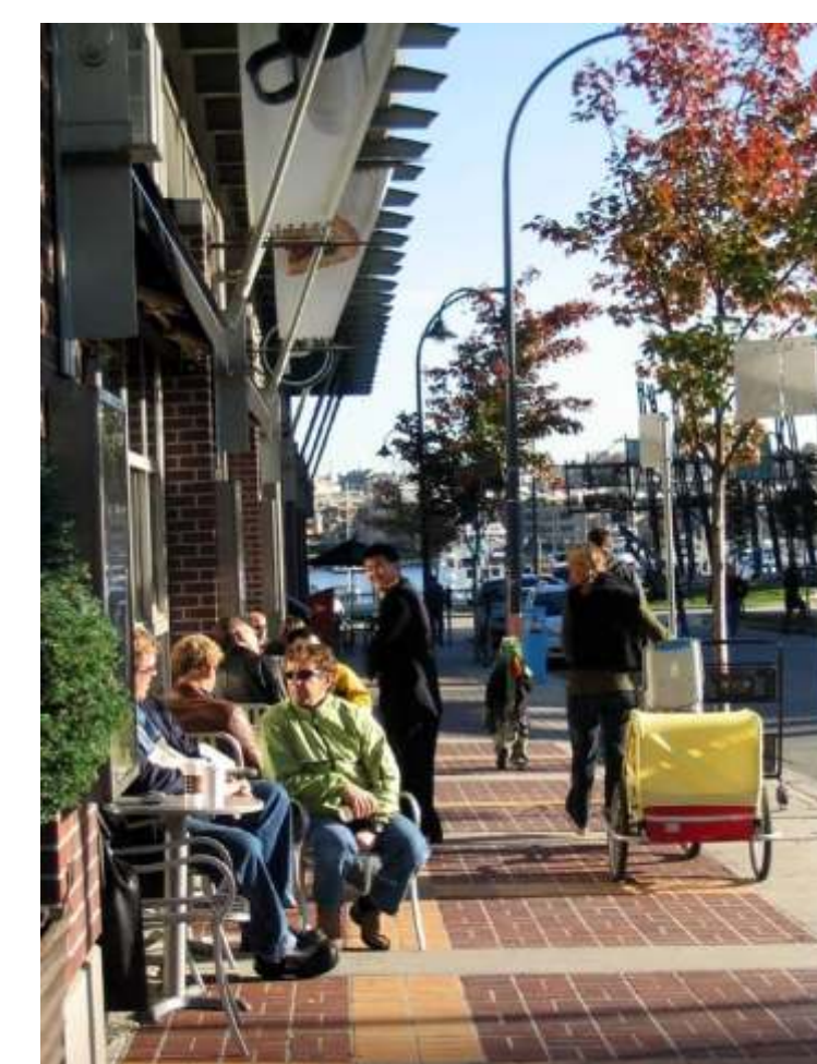
Active Yaletown sidewalk, Vancouver