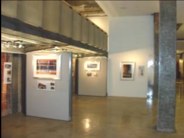
Gallery, Prince George