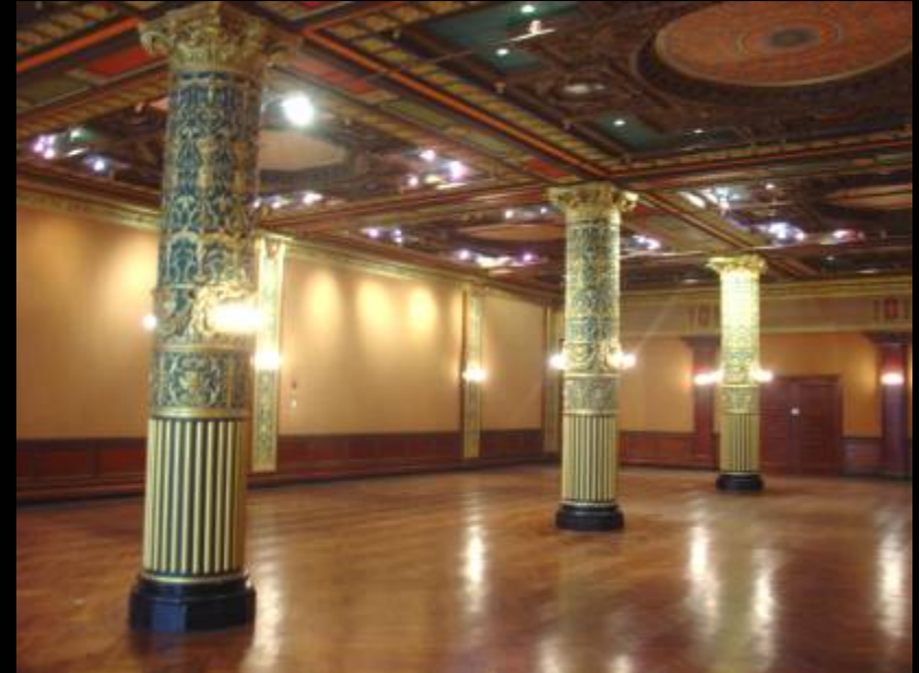
The newly restored ballroom, Prince George