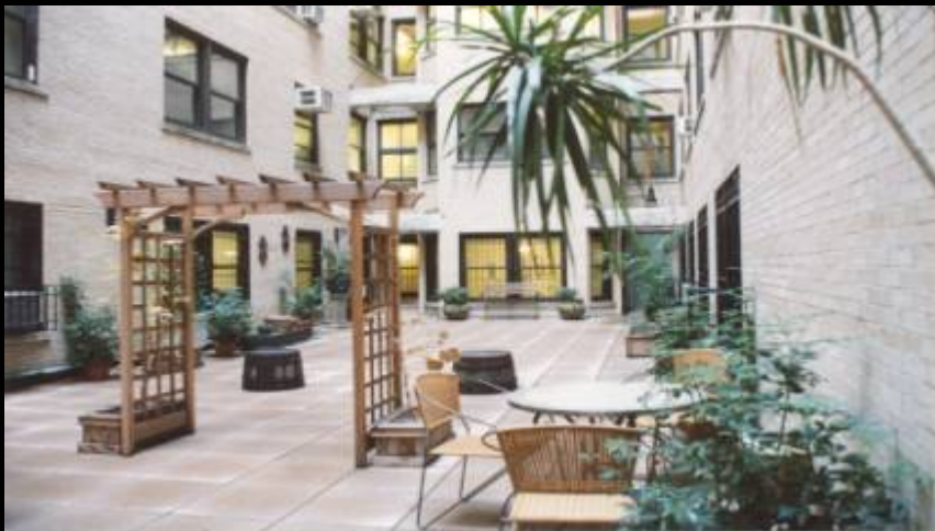
CG buildings feature rooftop terraces