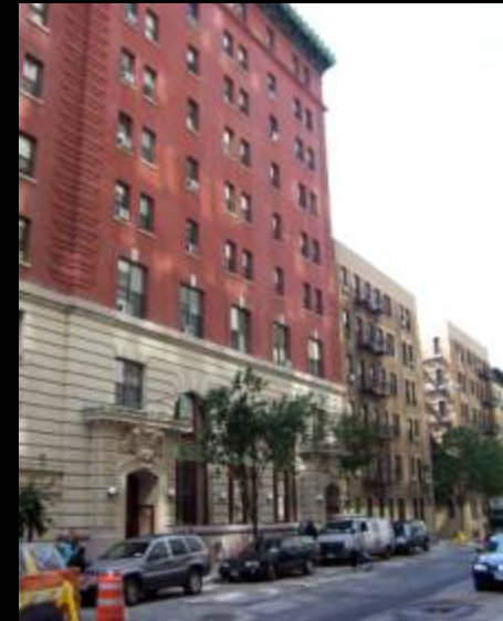
The Christopher Completed 2004 207 units