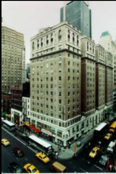
The Times Square Completed 1994 652 units