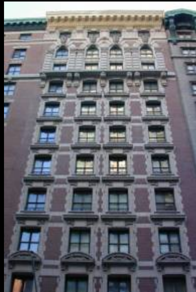
The Prince George Completed 1999 416 units