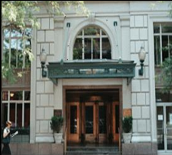
Entrance to The Times Square