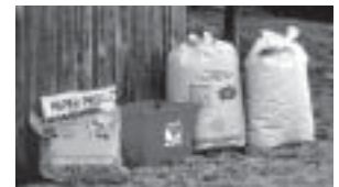
Recycling and yard waste collection

The City is working to be more environmentally responsible. In 2002, City Council adopted a definition of sustainability and a set of principles to evaluate City programs, policies, and practices. These include being accountable for individual and collective actions, using renewable resources fairly and reasonably, not compromising the choices of future generations, and collaborating with communities and other levels of government. The City also established an Office of Sustainable Development to further its commitment to preserve Vancouver's unique flavour — its natural environment, heritage, sense of design, and diverse communities — as a key component to Vancouver's future success.