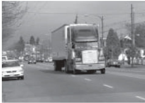
Tougher emissions standards would improve air quality