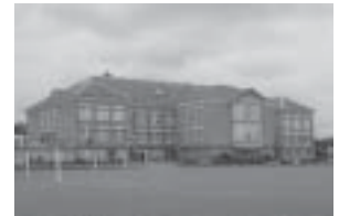
Norquay Elementary School