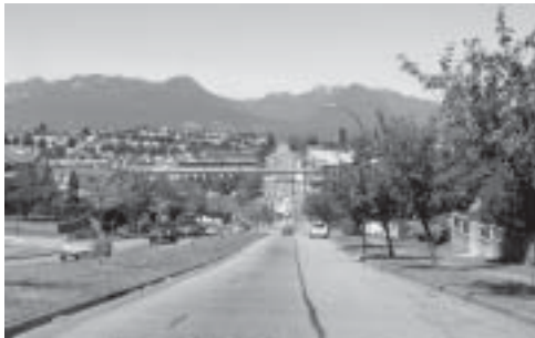
Rupert and 17th scenic view