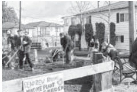
Community involvement in parks