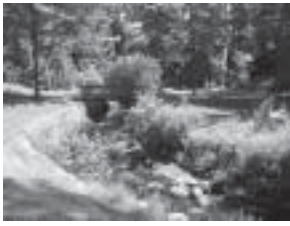
Still Creek in Renfrew Park