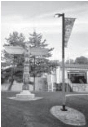
Public art in parks: Duchess Walkway