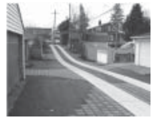
Greening lanes: 'Country Lanes' pilot project