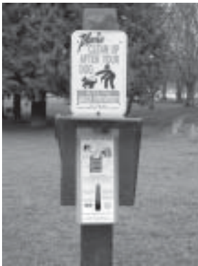
Clean-up parks for all users