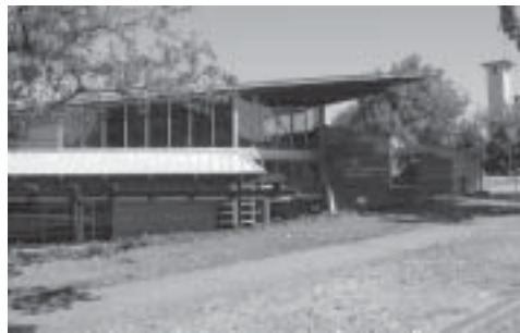
Renfrew Branch Library

In Renfrew-Collingwood, many existing public buildings, like schools and Firehall #15 (at 22nd and Nootka), are historic landmarks that provide many fond memories for long-term residents. Some recent buildings, like the Renfrew Branch Library, designed in a modern style, are also important landmarks. Vision participants felt public buildings should meet particularly high design and construction standards because they are heavily used and symbolically important. All designs should be welcoming, easy to access, and easy to find your way around in. Residents should also have opportunities to provide input in the development of these public buildings.