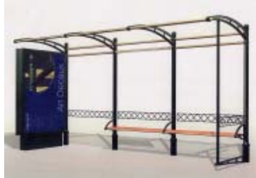
'Heritage Line' Bus Shelter