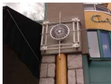
Building details using automotive hub caps