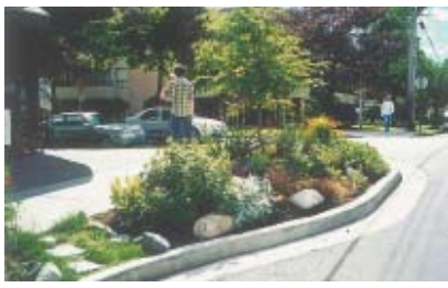
landscaped bulges at corner : consider 'Asian' plantings