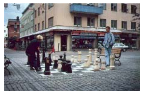
Giant-sized chess board in public space