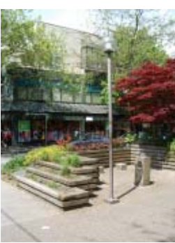
'Mini-public space' with drinking fountain, landscaping.