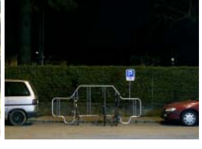
'Bike rack taking over parking space