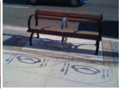
bench and sidewalk in-lays on Cambie Street