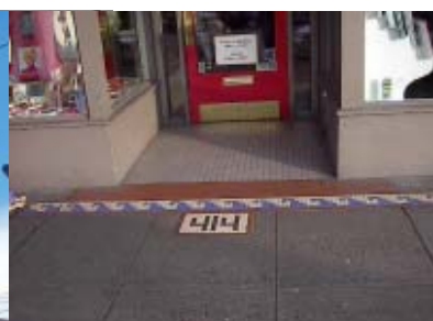
Building addresses embedded into sidewalk in tile