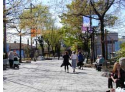
Pedestrian streets and passageways