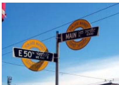
Unique Neighbourhood Street name signs