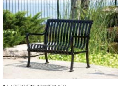
'Co-ordinated street furniture suite