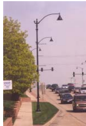
'Heritage' style luminaire with cut-off 'Dark sky' lens