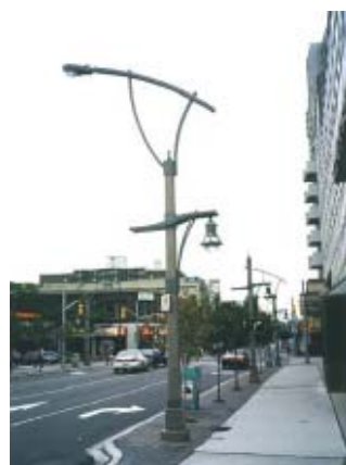
Both street lighting and pedestrian oriented lighting