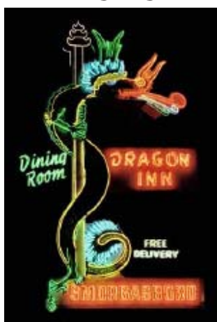
historic neon (this sign was at Slokan + Kingsway)