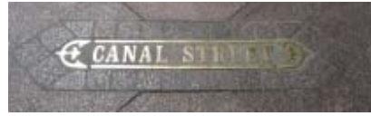
street names in-laid into sidewalk in brass