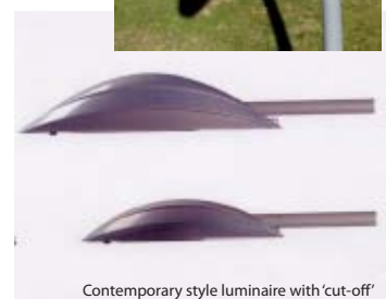
Contemporary style luminaire with 'cut-off' Dark sky lens