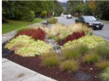
Permeable infiltration landscaping with rocks, not with standing water