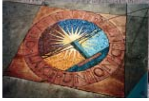
Neighbourhood 'logo' in-laid into sidewalk