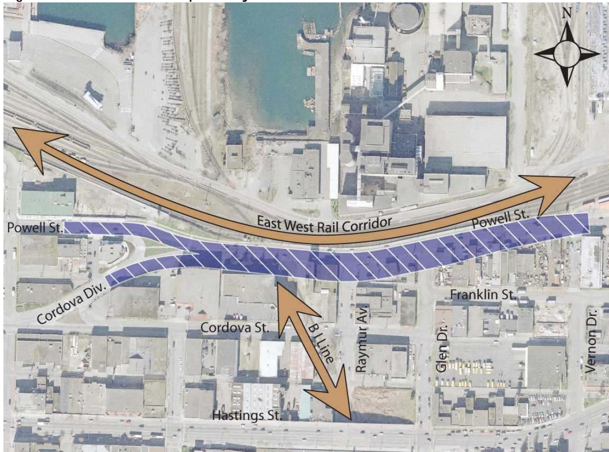
Figure 2: Powell Street Overpass Project Extents

The study report is expected to be completed in Feb 2009 and City staff have been coordinating with Transport Canada on the anticipated recommendations from the study. One of the recommendations expected is to call for the completion of the Powell Street Rail Grade Separation. The project extents for the Powell Street overpass are highlighted in the Figure 2 and the estimated capital cost is approximately $37M.