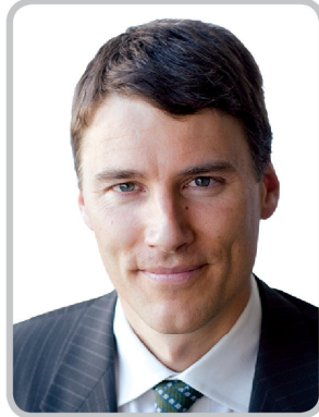
Mayor Gregor Robertson