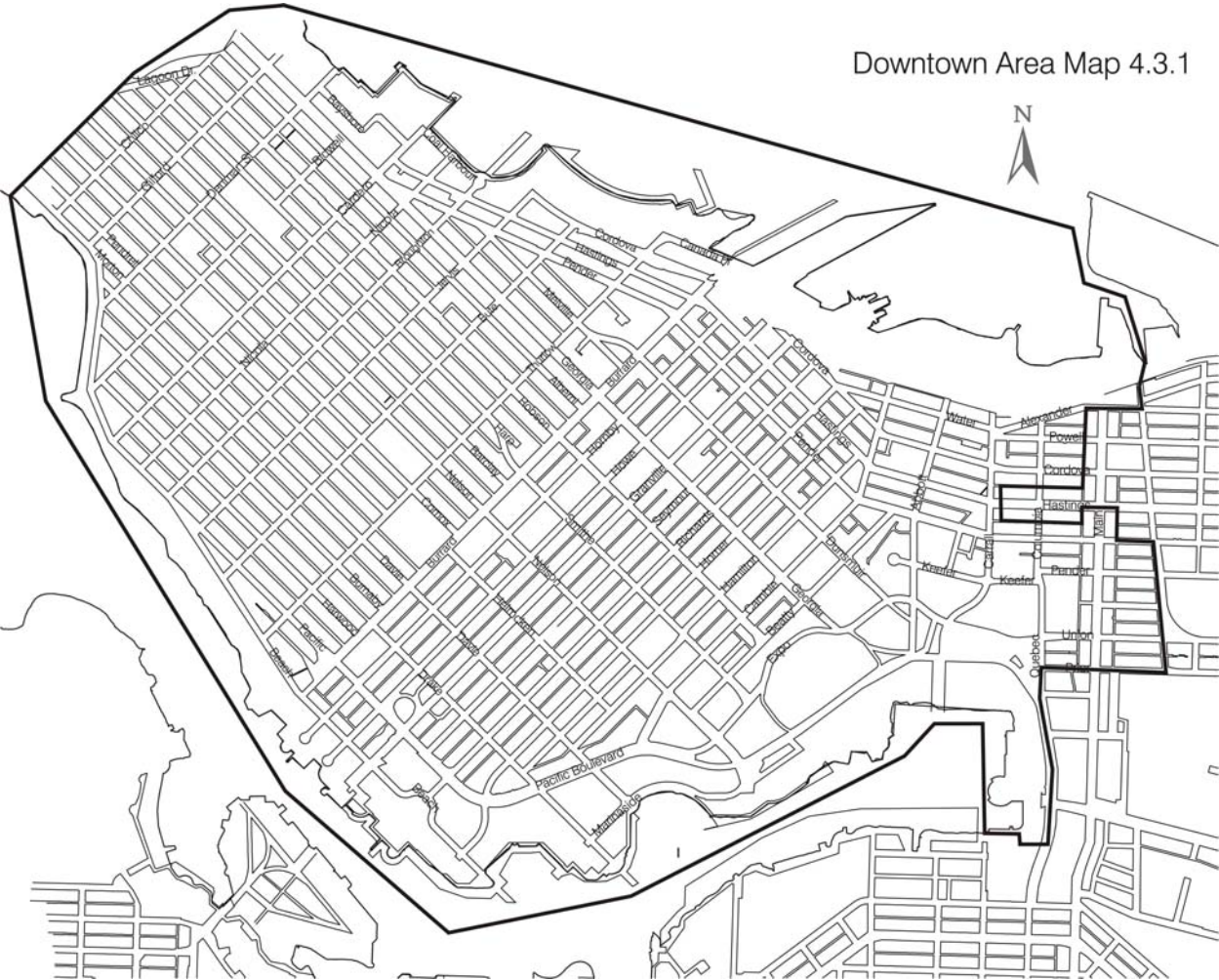
Downtown Area Map 4.3.1