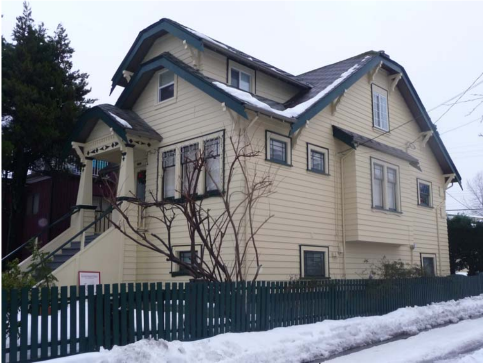
Pidruchny House, 2426 East 23 rd Avenue