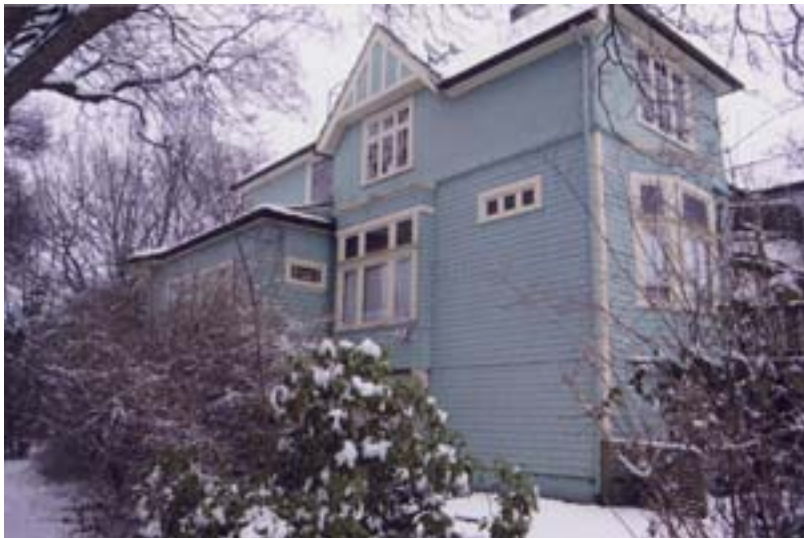
Figure 3. Kydd Residence, 2009