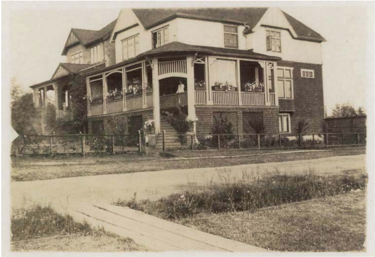
Figure 1. Historic photo of Kydd Residence (circa 1919)