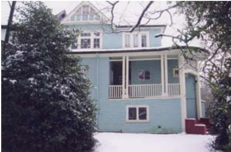
Figure 2. Kydd Residence, 2009