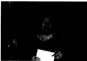
Member of Parliament Libby Davies

Canada's former Disarmament Ambassador, the Hon. Douglas Roche , whose powerful presentation on "The Human Right to Peace" was greeted with acclaim, commented that while he had attended many conferences there were few as productive as the PrepCon. "I'm one hundred percent behind you!"