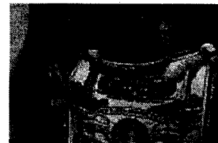
Alfred Marder of Peace Messenger Cities presents a gift to Mayor Campbell

On Saturday morning Vancouver's popular Mayor Larry Campbell welcomed participants and challenged those who would deny that civic politicians should leave peace issues to higher levels of government. Mayor Campbell stated the City of Vancouver's support in principle for the World Peace Forum in 2006. He announced his acceptance of Hiroshima Mayor Tadatashi Akiba's invitation to join with mayors from around the world at the United Nations review of the Nuclear Non-proliferation Treaty in May 2005. Mayor Campbell challenged the participants to come up with a practical plan on how to make a World Peace Forum in Vancouver a reality.