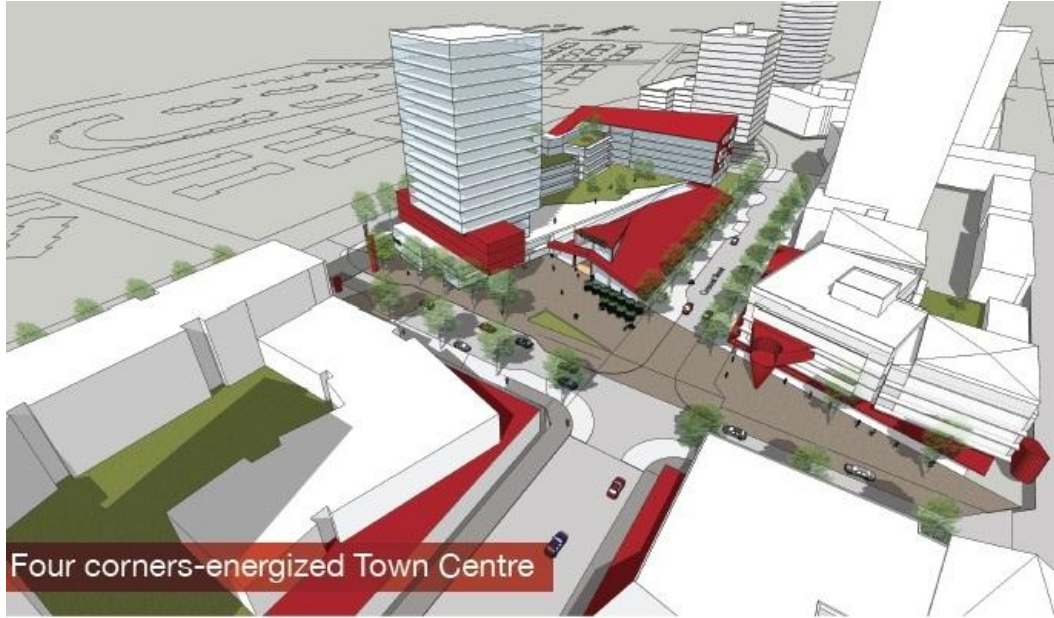
Rendering of Town Square