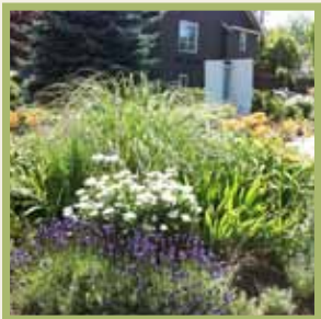
Lavender, daisies & daylilies create a lovely display of mid-summer colour.

Interestingly, Richard wasn't the only newbie on the block 10 years ago. Four homeowners moved into the area right around the same time. The