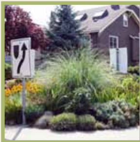
Drought-tolerant grasses and perennials create year-round texture and interest.