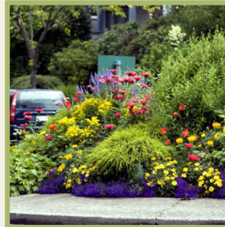
Ontario and 14th is a splendid display of colour from spring through to fall.

"I really want to do as much as I can to beautify [Vancouver], make it safe and a nice place to live. To get a sense of community wherever you live whether it's Downtown or Mount Pleasant - to