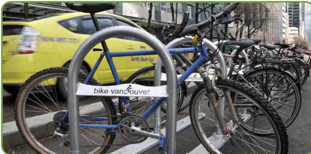
ON-STREET BIKE PARKING, DOWNTOWN

Through multiple support initiatives the City is working to provide continued cycling education and promotion with various partners, including other government, health and education sectors as well as advocacy, neighbourhood and business groups.