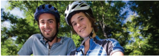
Provincial Helmet Legislation