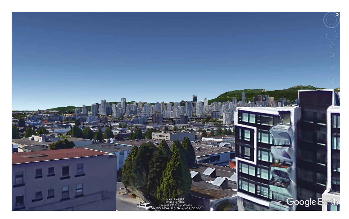
North West View