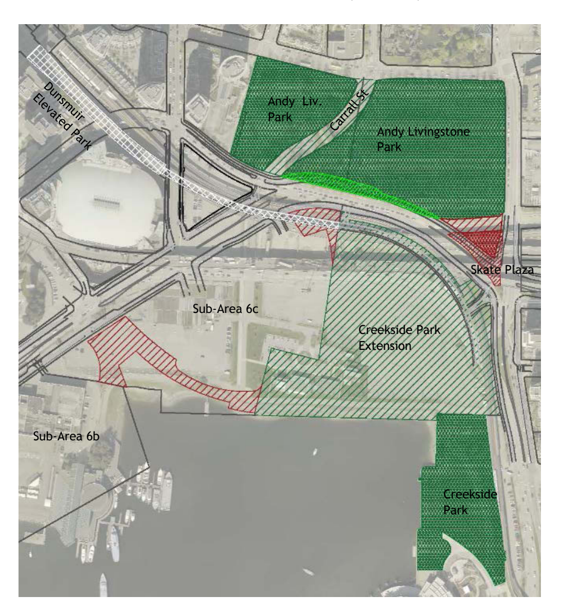
FIGURE 1: MAP OF SIZE PARKS AND OPEN SPACES (MAY 2017)