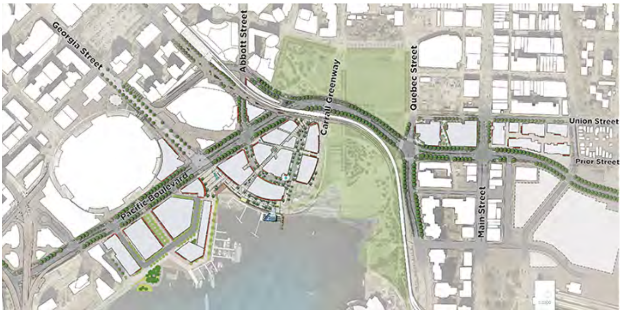
Figure 2: Future NEFC streets, parks, open space, and development in the NEFC Area Plan.