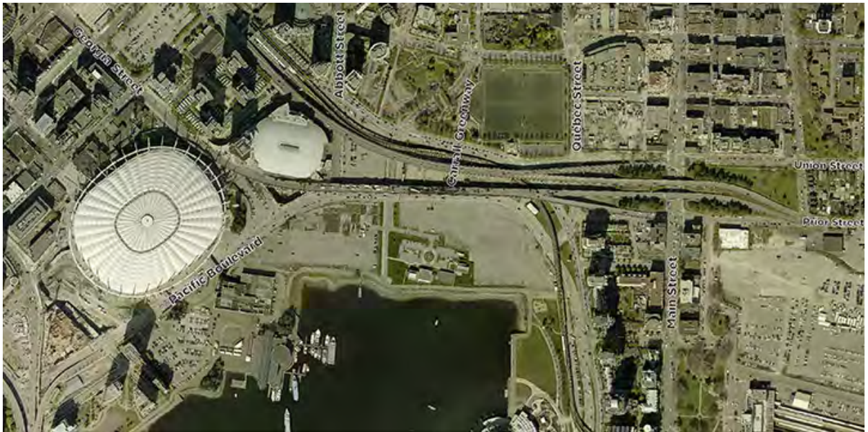
Figure 1: Current NEFC area streets development and viaducts