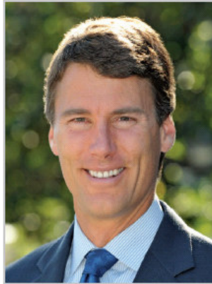
Mayor Gregor Robertson