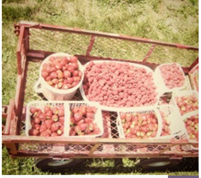
The bounty after a day of berry picking

» Participation in food programs offered by Park Board.