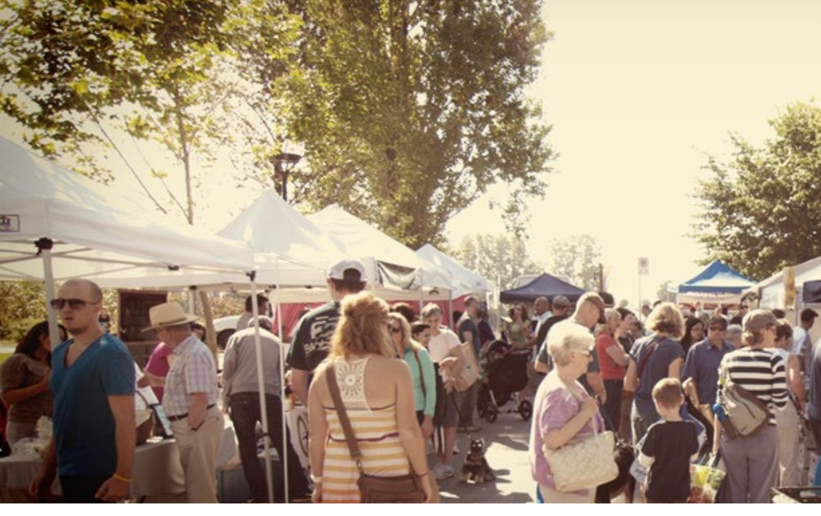
▲ Five farmers markets are located on or adjacent to Park Board land, with a considerable selection of locally grown and processed foods for city residents.

in parking lots of three community centres (Trout Lake, Kitsilano, Hillcrest) currently operate under special events permits, issued by the Park Board for a fee. Two farmers markets are located jointly on City- and Park Board land: Thornton Park and Nelson Park; the latter makes use of a Park Board water connection recently installed at the site. Two of these farmers markets offer complimentary bicycle valet service and food scraps drop-offs during market hours.