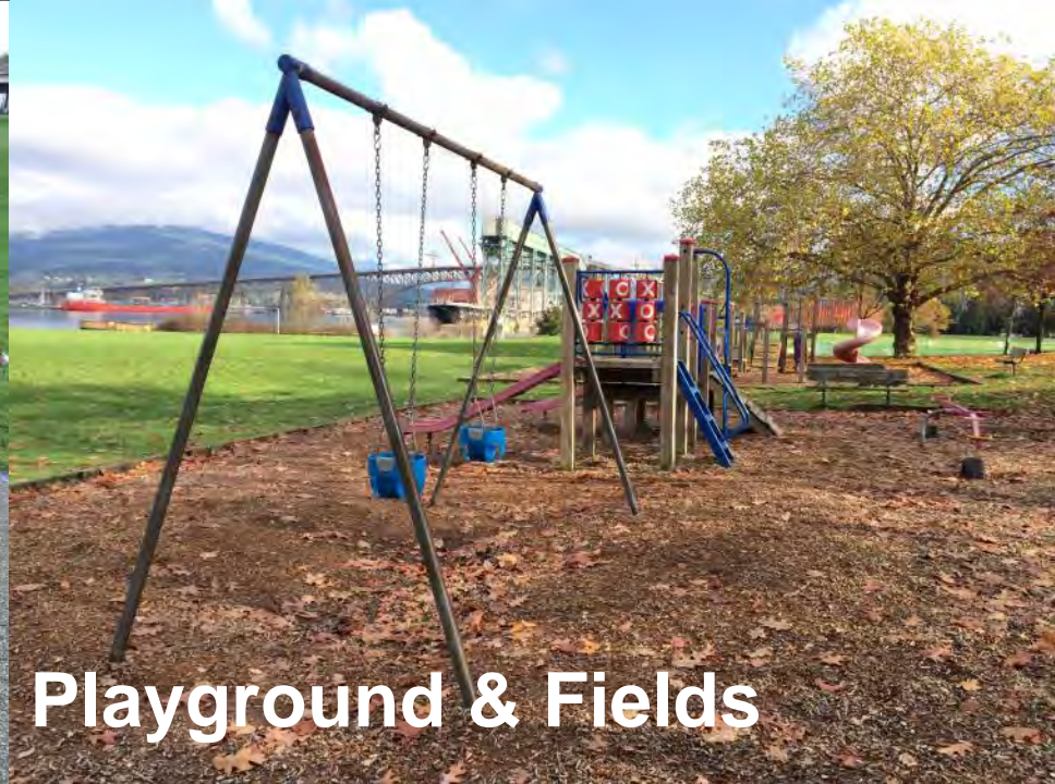
Playground & Fields