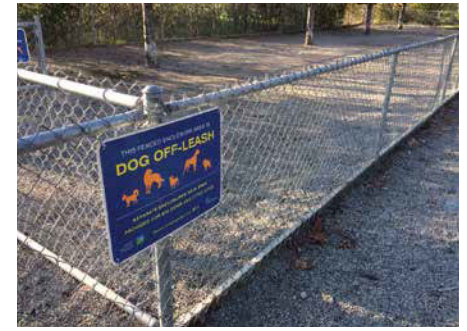
Example of a chain-link fence