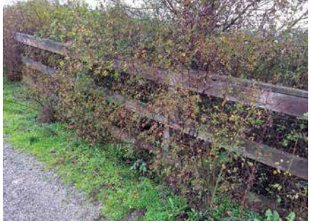
Example of a vegetated fence

B) Why is that? Please provide any comments you have regarding your preferences.