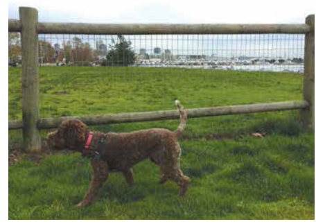
Example of wood posts with metal mesh