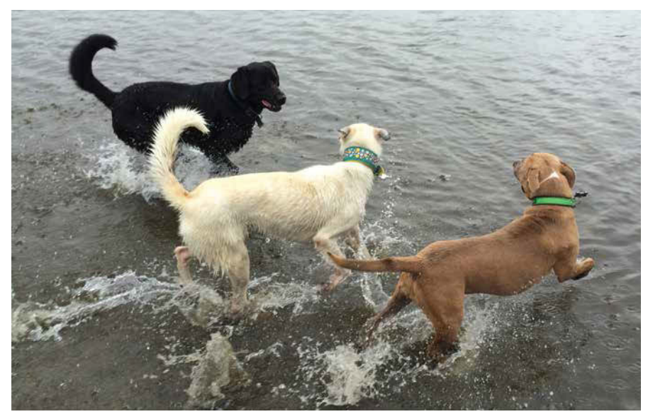
Park users told us access to water is an important part of off-leash activities in New Brighton Park