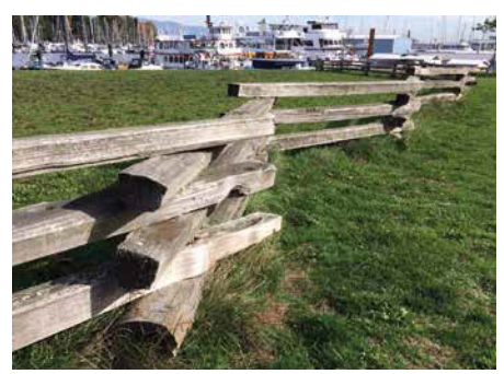
Example of a split rail fence