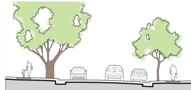
Cross Section D - D' Existing Conditions