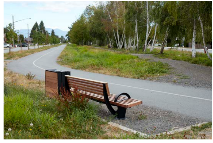
Greenways are "green paths" for pedestrians and cyclists