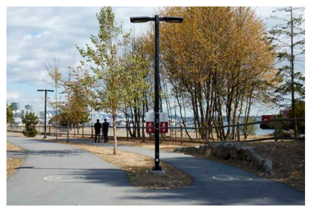
Separated asphalt path 2.5m walking / 2.5m cycling E.g. Spirit Trail, North Vancouver