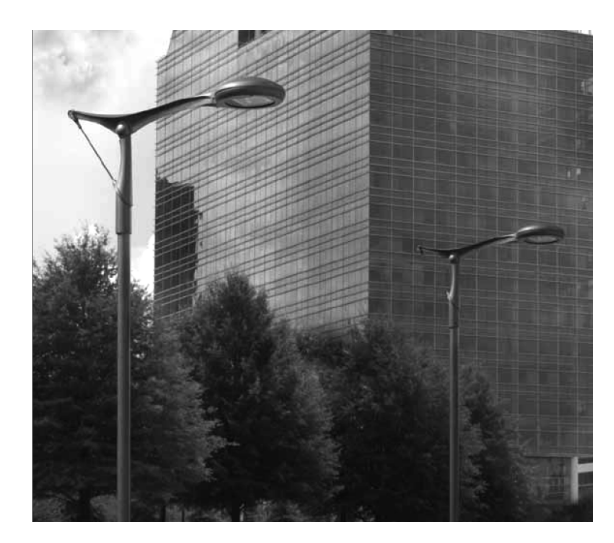
INVUE LED (STREET)