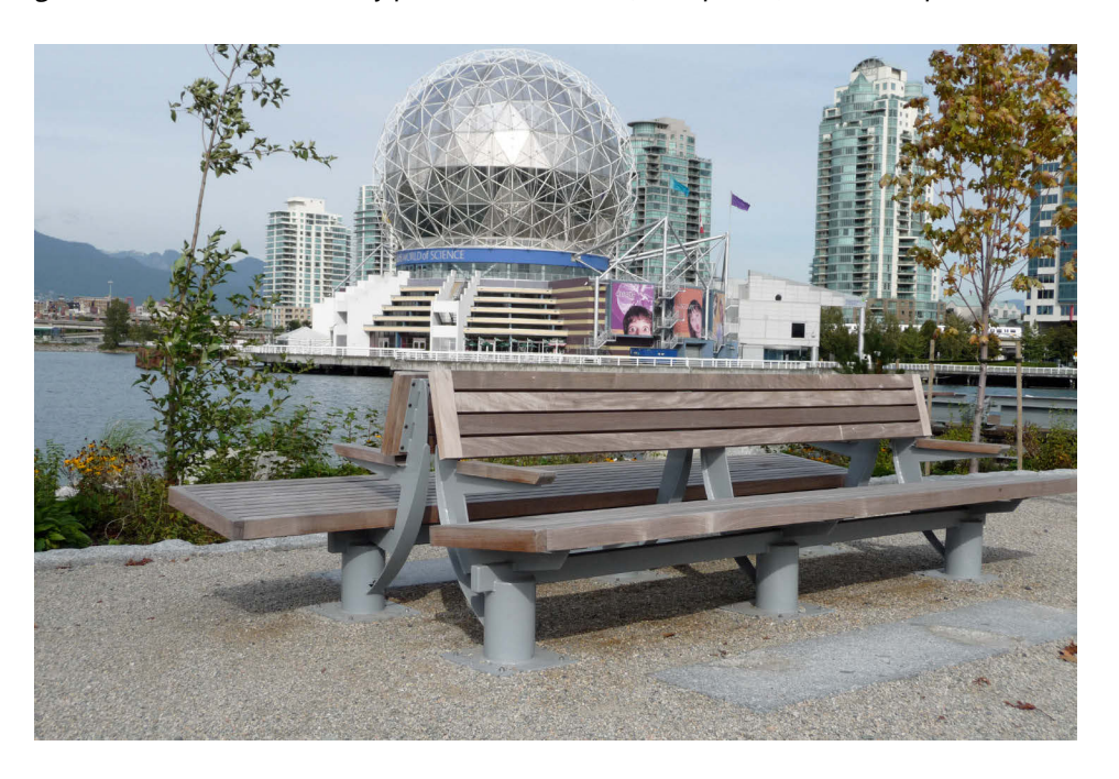
SEFC WATERFRONT BENCHES. SEE LANDSCAPE FURNISHING KEY PLAN FOR PROPOSED LOCATIONS OF BENCHES

The developer is encouraged to utilize the SEFC benches and or modified benches on the private parcel areas and zones that are in close proximity to the public realm. Areas where these benches or modified benches are suggested include street or entry plazas off sidewalks, lane plazas, and corner plazas.