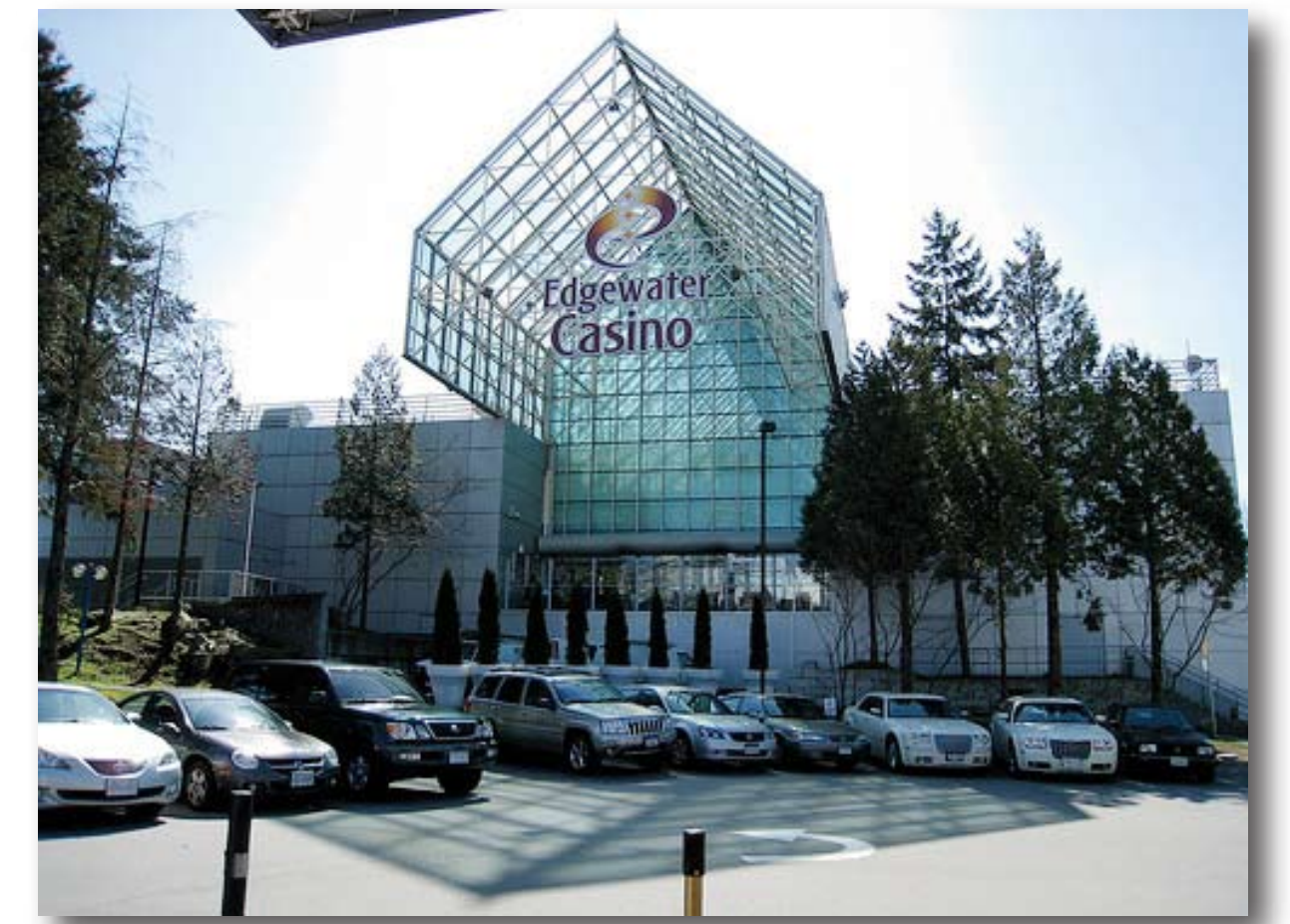
The Edgewater Casino at Plaza of Nations