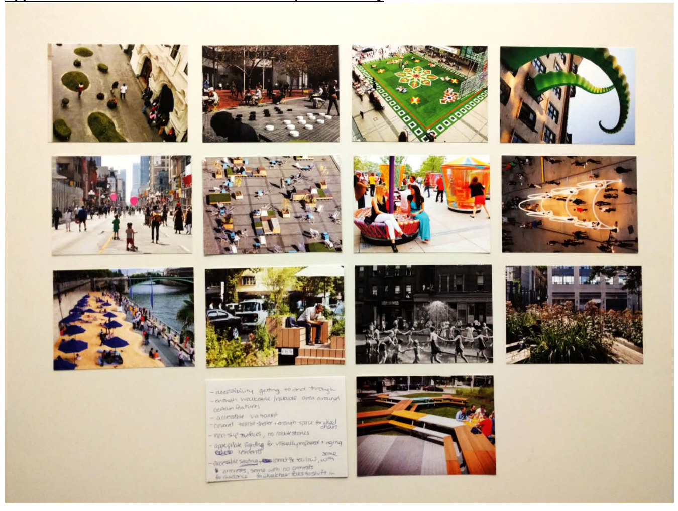
Appendix 3 - Selected Cards from Public Space Activity