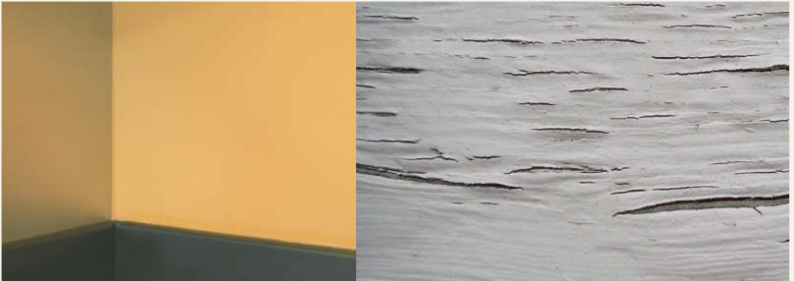
Table adapted from the National Parks Service Historic Preservation Brief #10 "Exterior Paint Problems on Historic Woodwork", available at www2.crnps.gov/tps/briefs/brief10.htm and used with kind permission.