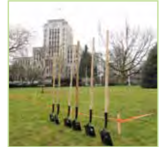
The City Hall community garden is in the planning, tendering and community consultation stage. It's a symbolic but important step towards encouraging more local food production.

Clusters of up to 30 fruit trees could be planted in parks such as Sunset, Fraserview, Quilchena and Cambie Park. These orchards could be managed and maintained in partnership with community groups such as the Environmental Youth Alliance, the Vancouver Fruit Tree Project Society, or a Community Centre Association.