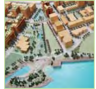
False Creek and Great Northern Way could become model sustainable communities and should be reinvigorated as special “green zones”.

Oakland recently launched the Oakland Green Jobs Corps, awarding $250,000 to three community groups that will train young adults to take jobs in renewable energy and energy efficiency. Addressing social and environmental problems with one solution, the Green Jobs Corps aims to provide a shining national example of using the rising green wave to “lift all boats.” 10 Portland recently developed a green jobs strategy that targets and attracts particular industry sectors.