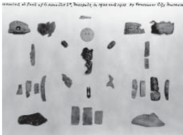
Artifacts from the Marpole Midden, 1931