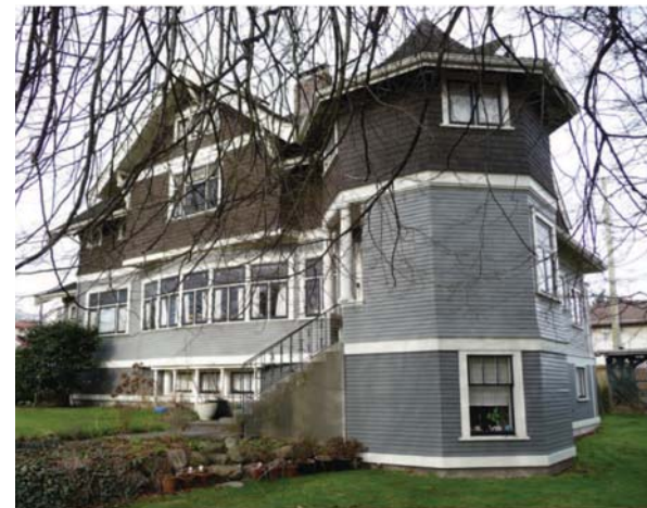
Heritage building, 1179 W. 67th Ave.