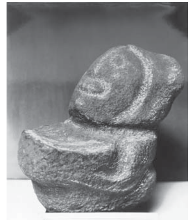
A medicine man's altar from Great Fraser River Shell Mound exhibit, 1931