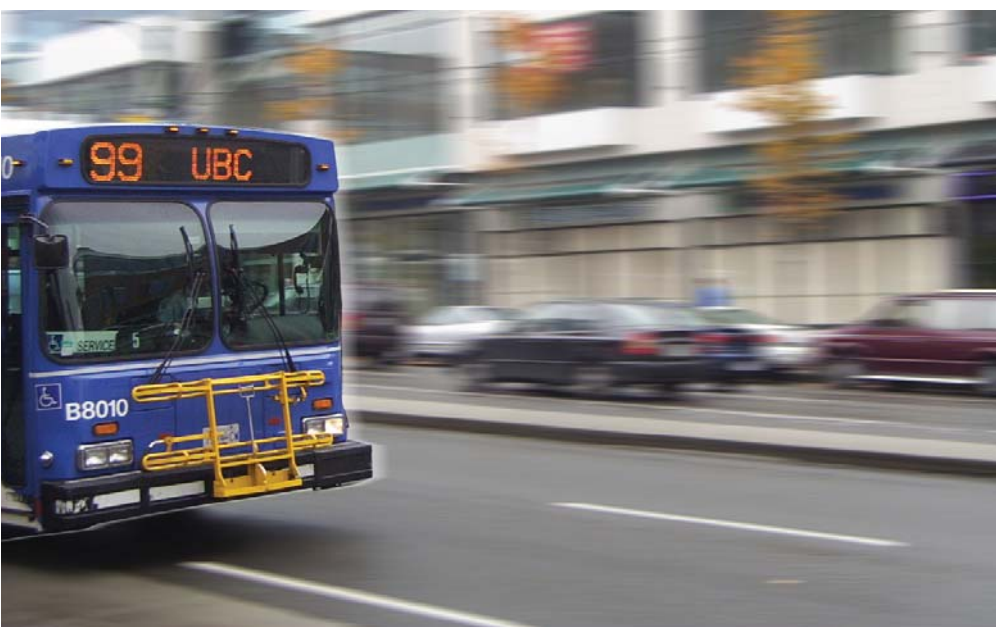
Regional / Provincial (e.g. schools, health care, transit, affordable housing)