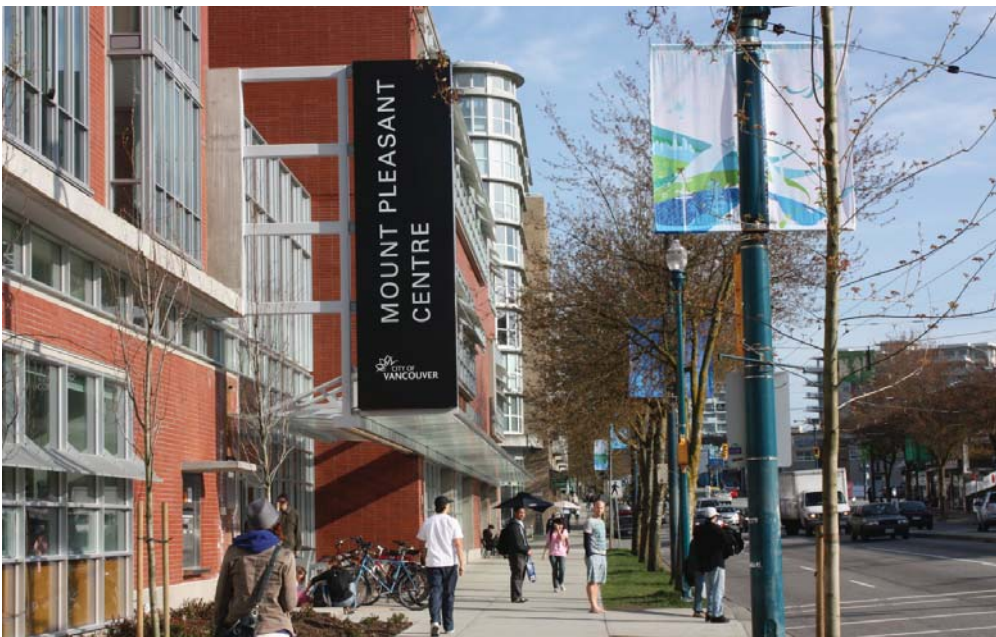
City (e.g. parks, community centres, libraries, street improvements, affordable housing)