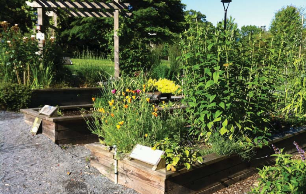
Community Partnerships (e.g. community gardens, neighbourhood greenways)