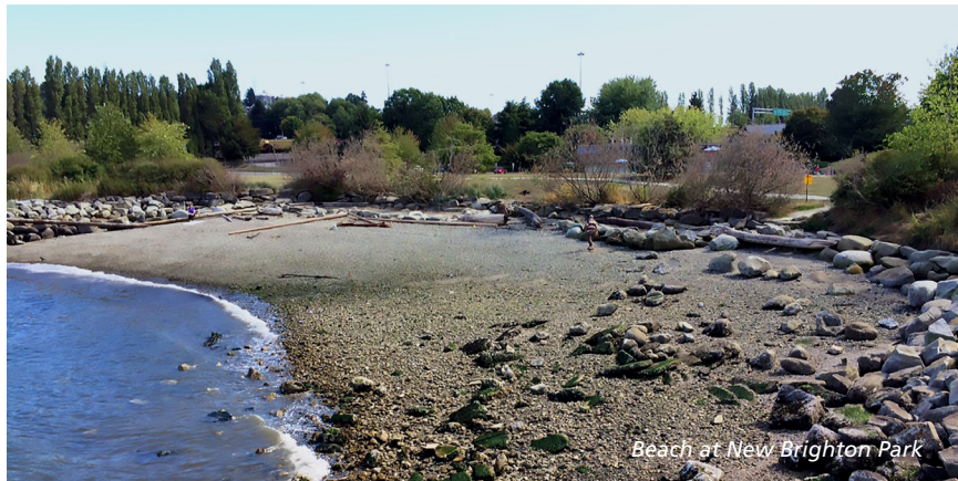
Beach at New Brighton Park

Detailed Design Public Consultation May 2 – 27, 2016