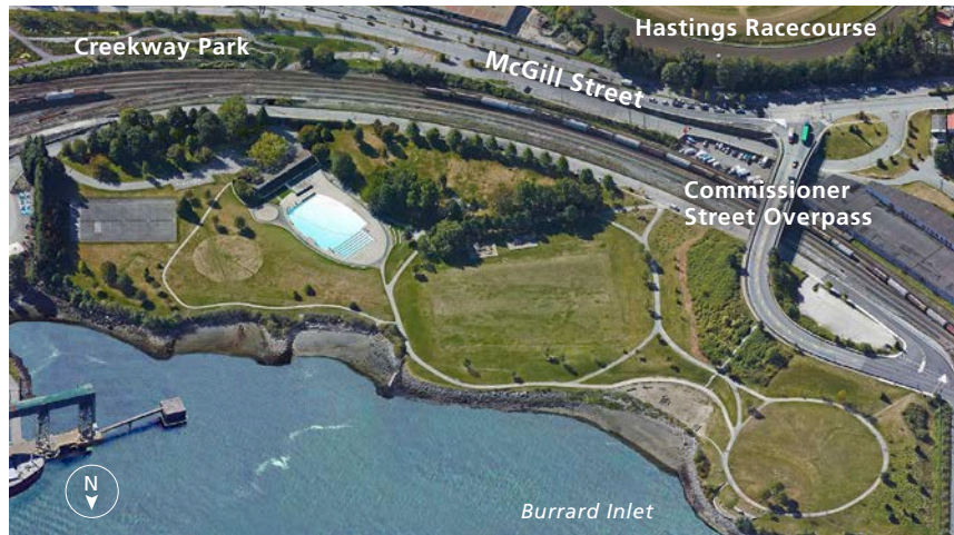
New Brighton Park today

In consideration of feedback received during Public Engagement Regarding Dog Off-Leash Areas, the project team is proposing a dog off-leash area located on the west side of New Brighton Park, shown in the illustrative concept below.