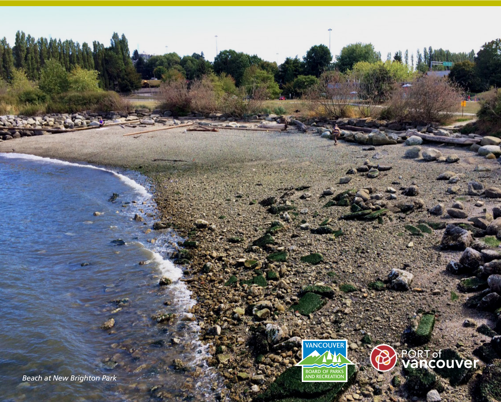
Beach at New Brighton Park