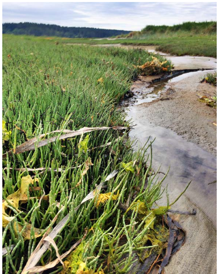
Image of an existing Salt Marsh, Sidney Island B.C.

The site has been selected based on its potential to benefit a broad range of fish and wildlife species and increase the overall ecological function of the area. The proposed project would restore and enhance a historically filled foreshore and upland area to provide high-value habitat for fish, birds and other wildlife, and increase public access to nature. The creation of a tidal wetland feature would also improve habitat in Burrard Inlet for juvenile salmon rearing.