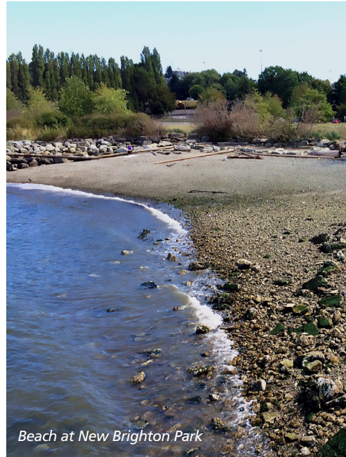
Beach at New Brighton Park

For more information regarding the proposed project, please visit: vancouver.ca/newbrightonsaltmarsh .