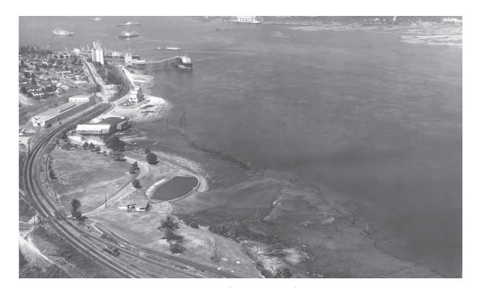
New Brighton Park in 1961, before land filling created the current shoreline. Note that the outdoor pool used to be located next to the shore.

Historical uses of the proposed project site, prior to its development into a municipal park, were primarily for lumber-related industries, particularly shingle manufacturing. A review of aerial photos indicates that the current shoreline visible today was created through fill placement in the 1960s, which resulted in the loss of valuable fish and wildlife habitat.