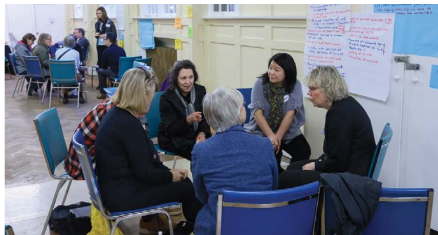
Residents and representatives from West End community groups share their input at a Providence Health Care community forum on the new St. Paul's in February 2015.

As part of clinical planning , Providence Health Care (PHC) initiated a public consultation process, in partnership with Vancouver Coastal Health (VCH), to understand the health care needs of the community and how the new St. Paul's could best support these. The input collected in this process helps inform decision making around health services planning for the new St. Paul's Hospital and health campus.