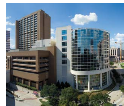
Texas Medical Center - Houston, TX

The best examples of urban health campuses today are well integrated into their surrounding neighbourhoods and serve as catalysts to encourage healthier communities.