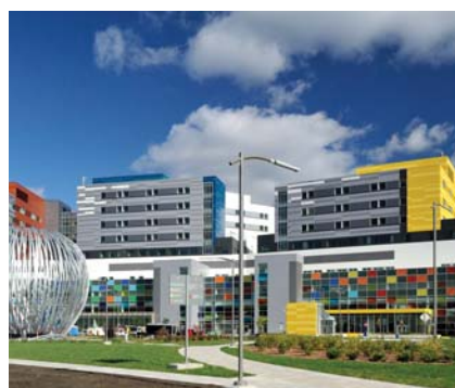
McGill University Health Centre - Montreal, QC

The New St. Paul's Integrated Health Campus at Station Street will share some characteristics with other world-renowned medical centres located in dense urban settings. At the new St. Paul's, a range of health care programs and services will be accommodated in purpose-built facilities and the campus itself will be well-connected and integrated into the surrounding area.