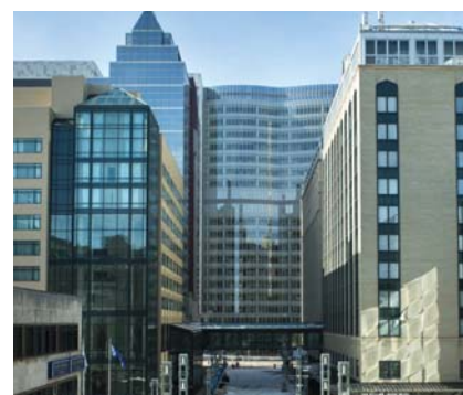
Mayo Clinic - Rochester, NY