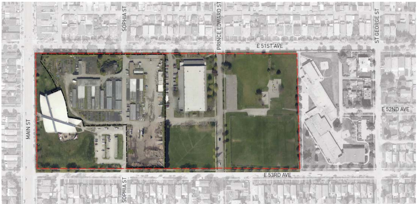
Sunset Park today

The Vancouver Park Board is developing a master plan to renew Sunset Park by improving and better connecting its features. Renewing the park was a top priority we heard about in the public consultation for the City of Vancouver 2015-2018 Capital Plan. The plan will review the usage and condition of existing park features and identify short and long-term park improvements.