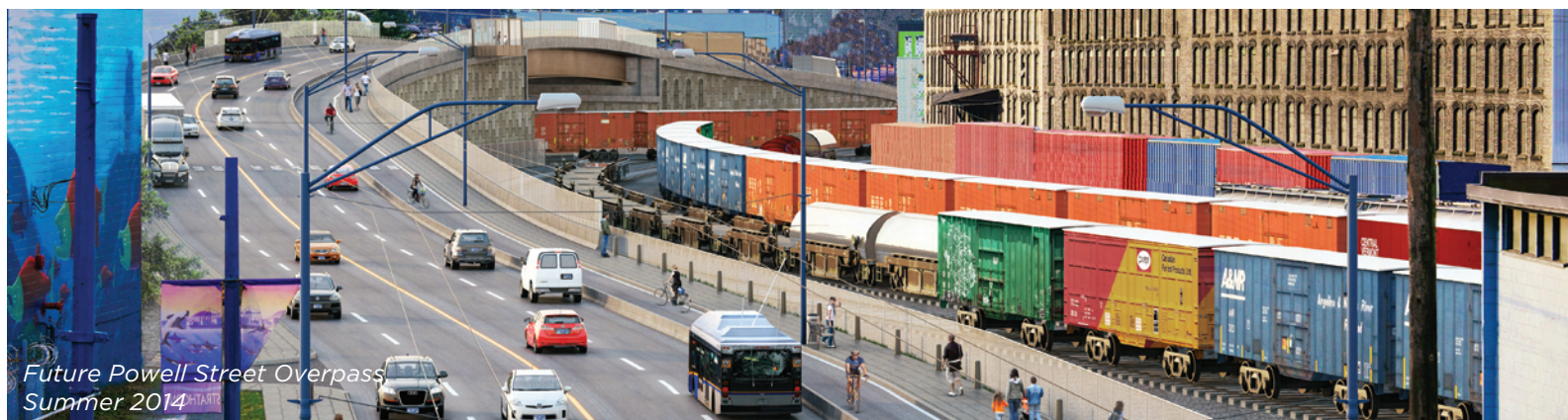
Future Powell Street Overpass Summer 2014