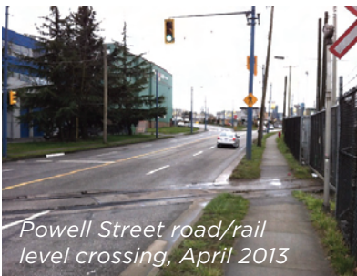
Powell Street road/rail level crossing, April 2013

Greenways are pedestrian and cycling corridors through the city that connect parks, nature reserves, cultural features, historic sites, neighbourhoods and retail areas.