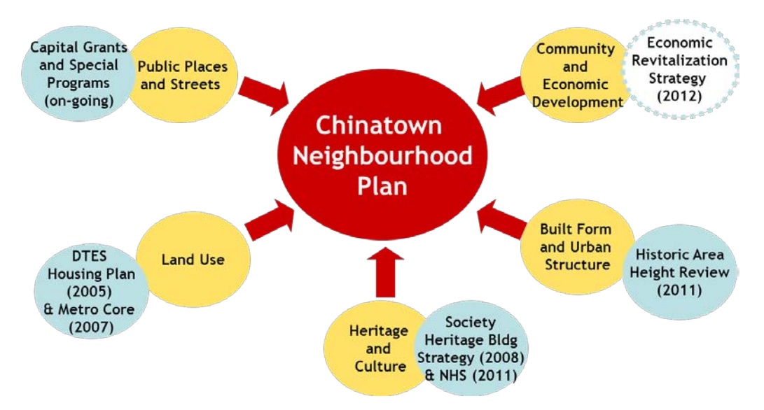
Figure 2. Chinatown Plan's Five Key Areas

Below is an overview of the community plan revitalization work completed and in progress, more detail can be found in Appendix A: