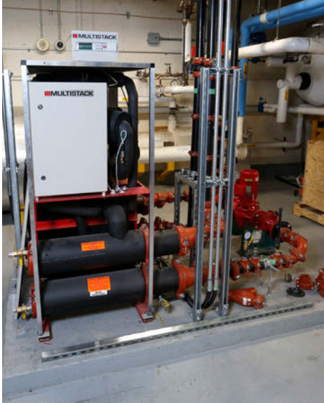
Multistack Heat Recovery Chiller installed in the mechanical room.