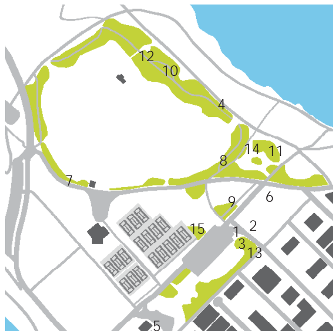
1-5 Crocus sp.

Crocuses provide some of the first colour in the Ted and Mary Greig Rhododendron Garden in late winter. Clusters of them sprout up throughout the garden, particularly north of the Nelson Street parking lot and throughout the Azalea Walk.