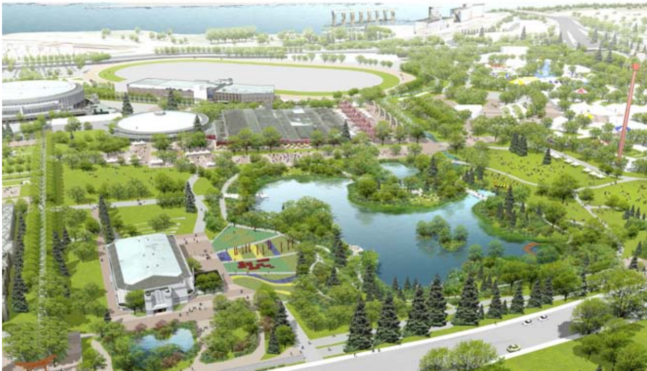
View Looking Northeast over the Future Hastings Park