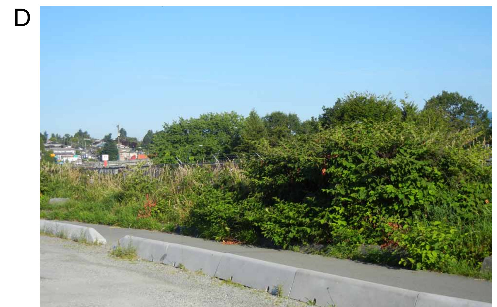
Invasive plant species exist throughout the site and are currently growing over the bike trail