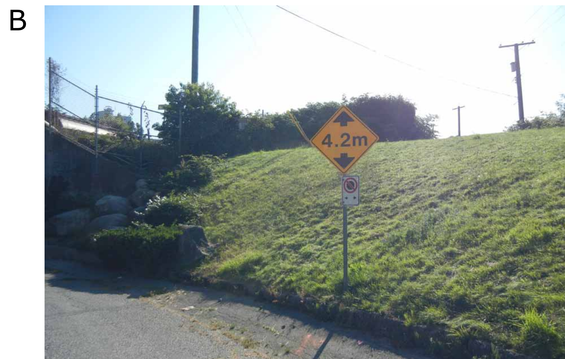
Steep topography presents a barrier to fish passage