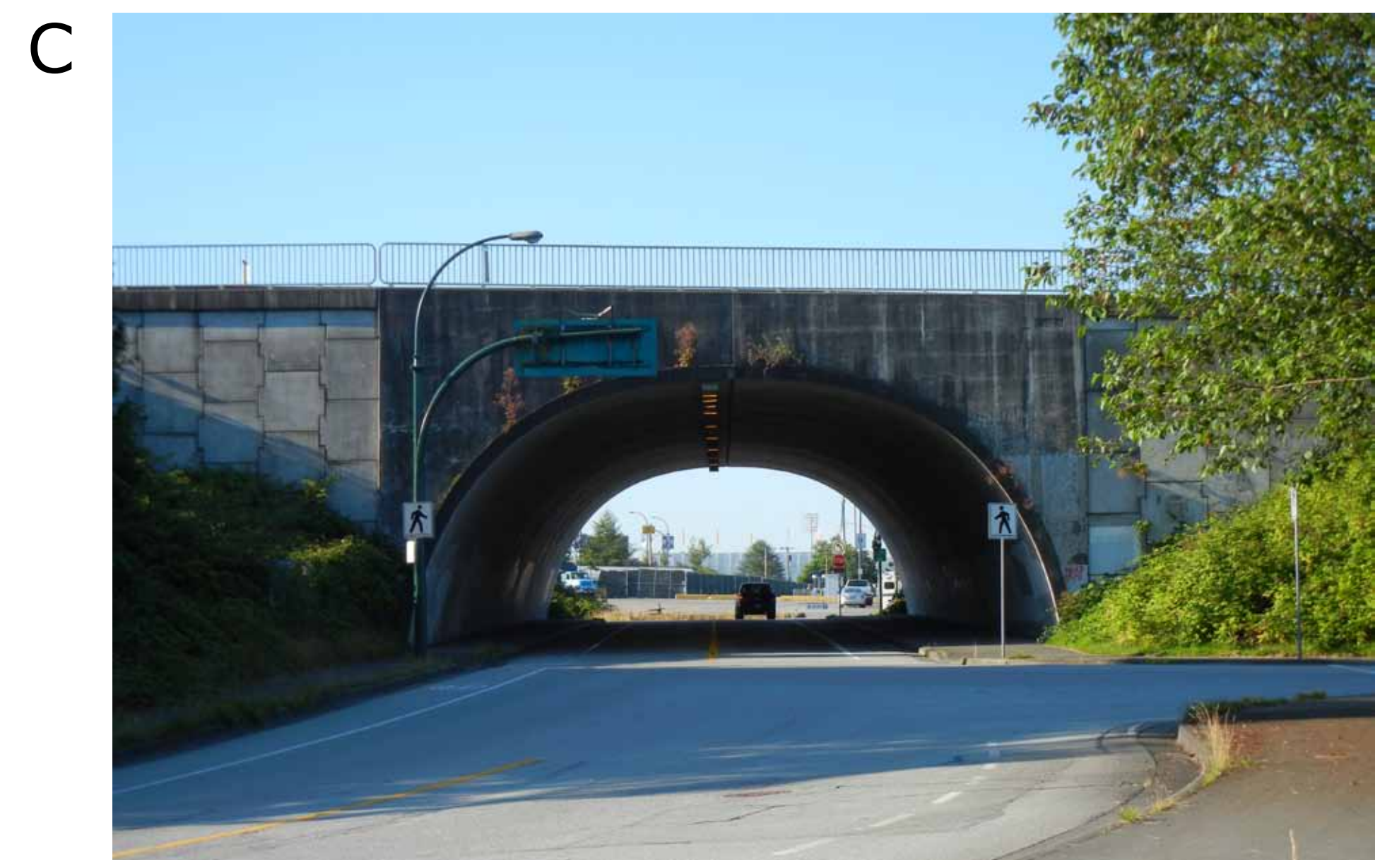
The McGill tunnel presents a barrier between Creekway Park and Hastings Park