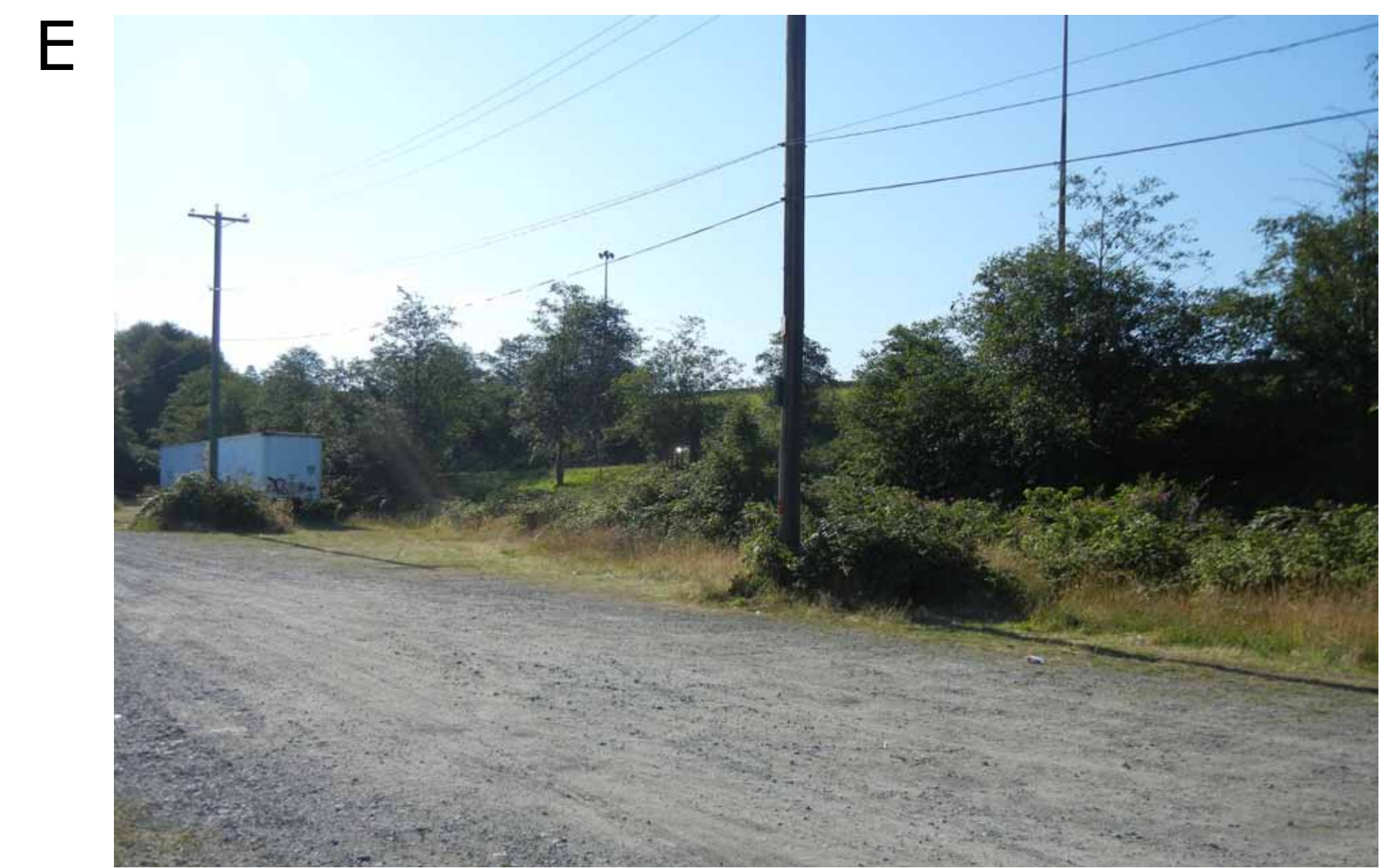
High voltage power line above ground present constraints to site development, such as path alignment and tree planting