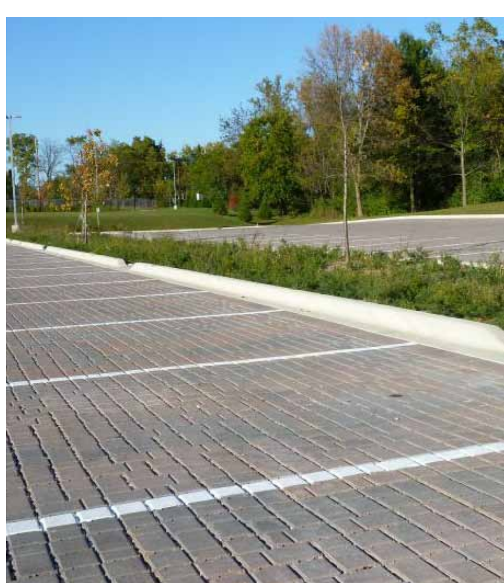
Examples of Green Parking Lots with Permeable Paving and Stormwater Swales