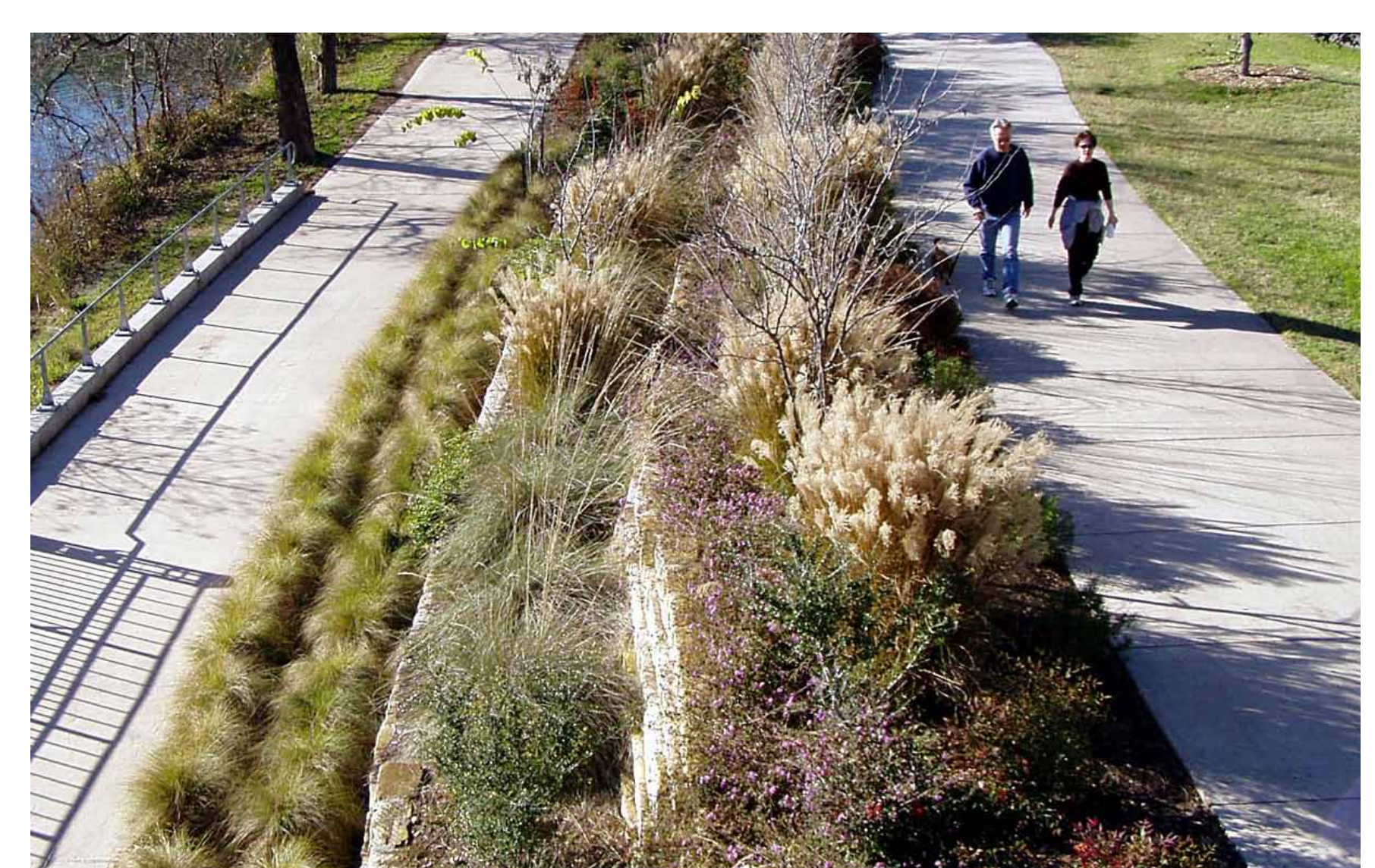
Example of Greenway