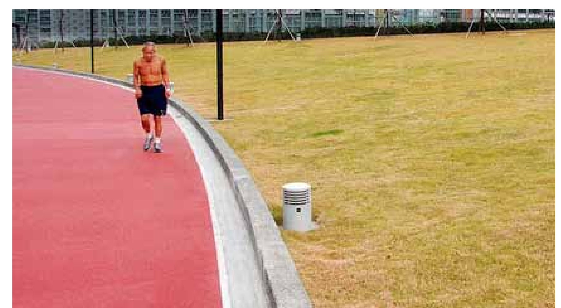
Examples of Informal Running Path Used for Walking, Jogging and Running