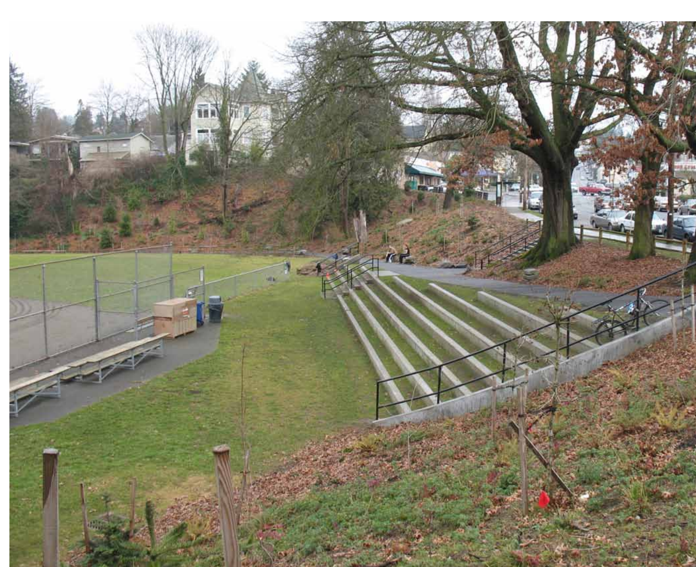
Example of Seating on a Slope