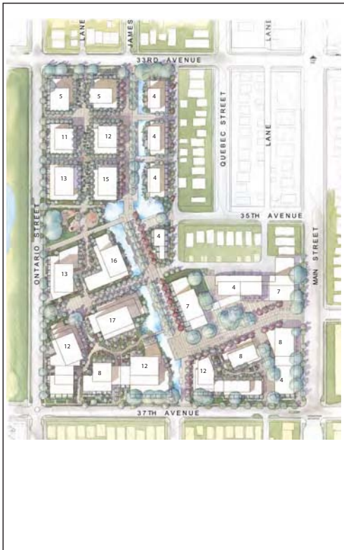
July 2011 Open House 2.75 FSR (gross)