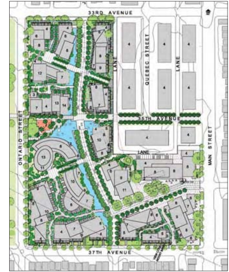
January 2012 Current Holborn Concept 2.8 FSR (gross)

The throat of the 35th Avenue access west of the lane should be increased somewhat to allow for a standard city street width and building setbacks.